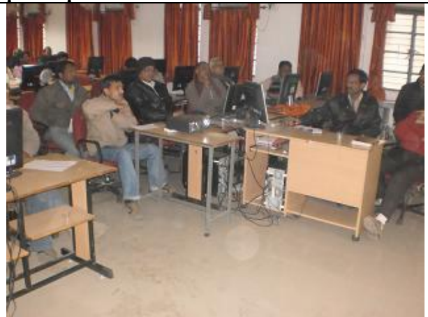
NIC & DOTW officers during feedback session

-District Informatics Officer, NIC, Morena, M.P.