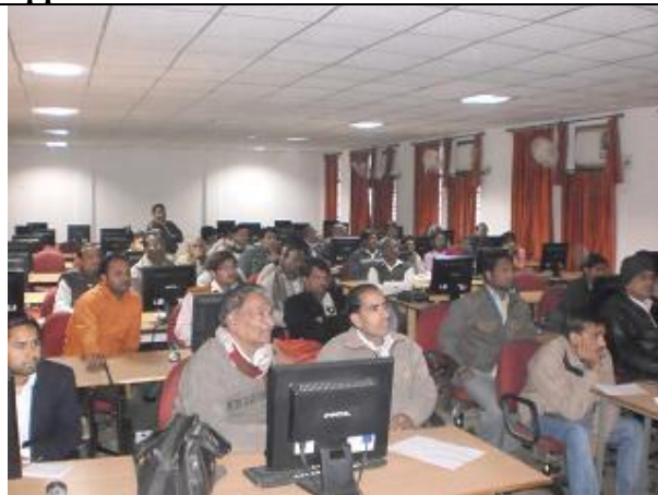
Around 74 participants at Poly. College computer Lab